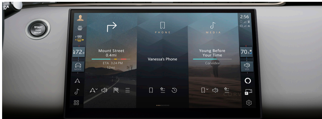
Intuitive Pivi Pro infotainment provides immediate start-up with elegant new 11.4-inch curved floating glass touchscreen and haptic feedback.