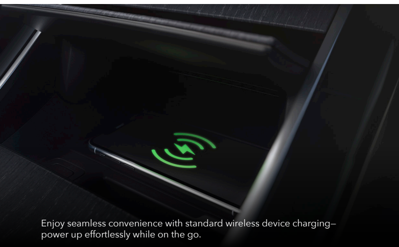
Enjoy seamless convenience with standard wireless device charging—power up effortlessly while on the go.