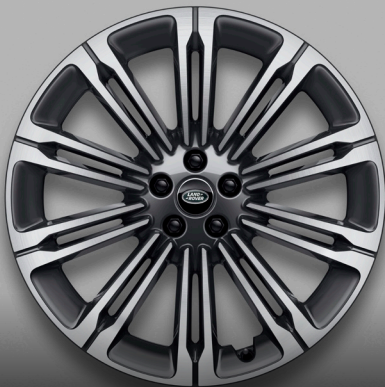
20" Style 1085, Gloss Dark Grey with Diamond Turned contrast.

The Range Rover Evoque makes a statement wherever it goes with a striking balance of technology and luxury. Its distinctive coupé-like silhouette is finished with flush deployable door handles and 20" wheels. Whilst inside, the latest technologies make your journey easier and more connected. Start a new adventure today.